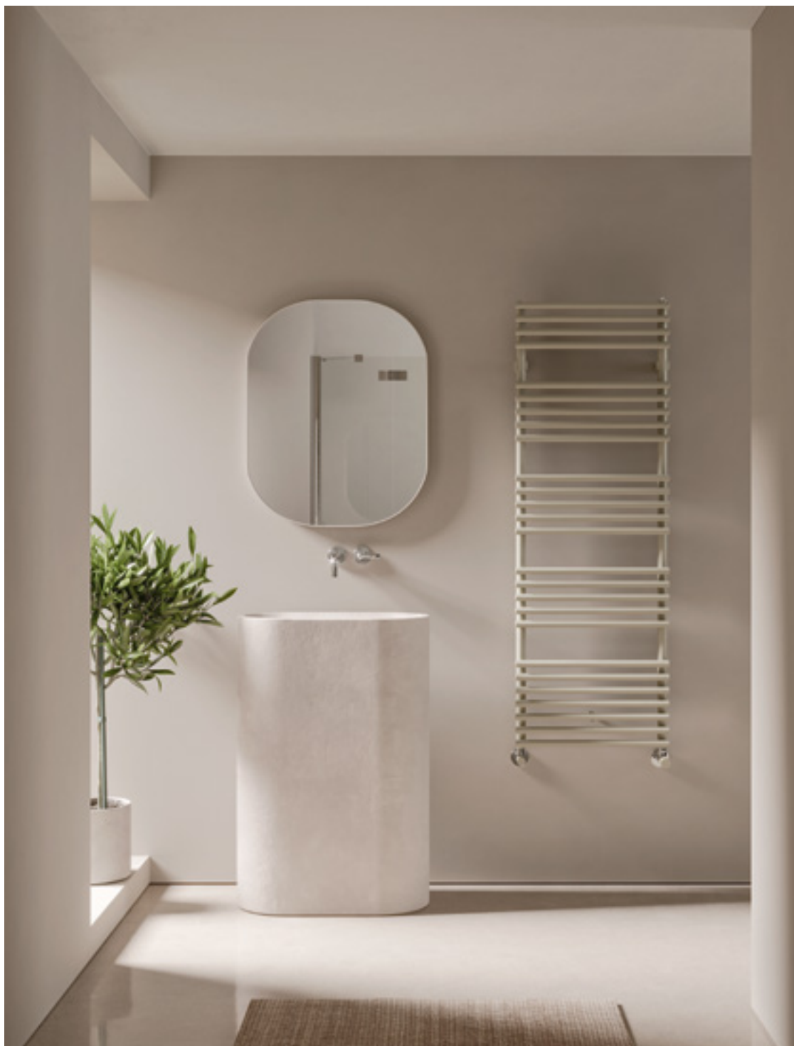
KART height 1456 mm, length 500 mm. Matt Light Grey finish (cod. 8N).